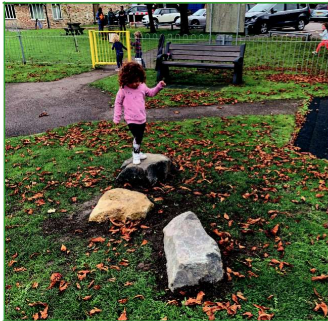
Three Climbing Boulders