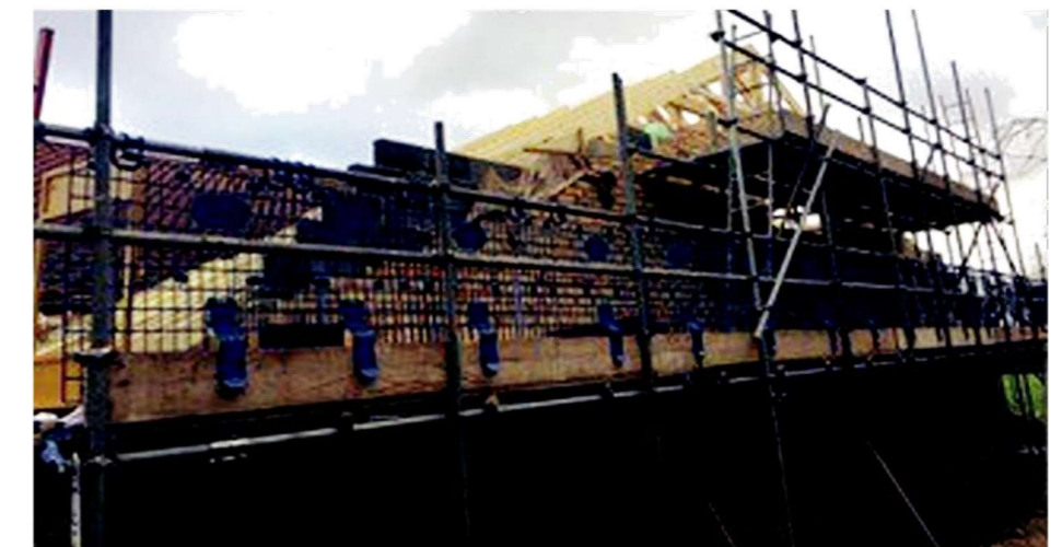
Work in Progress on the first-floor extension

Strip out of the current kitchen will commence at the start of February so that work can start on the enlarged kitchen and a temporary basic kitchen facility, (fridge and kettles), will be created to enable users to make tea and coffee. The new kitchen will not be available until the completion of the project which is planned for early June 2020.